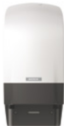
Katrin System Toilet Dispenser White