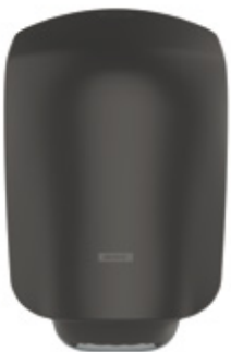
Katrin Centerfeed M Dispenser Black