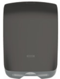
Katrin Hand Towel Mini Dispenser Black