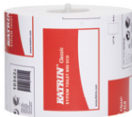
103424 Katrin Classic System Toilet ECO 2-ply, ECO, 800 sheets