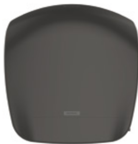
Katrin Gigant L Dispenser Black