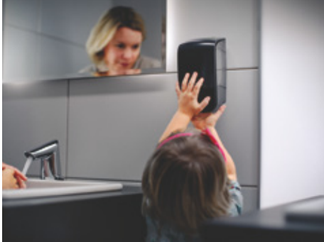
The full-face push cover makes dispensing easy.