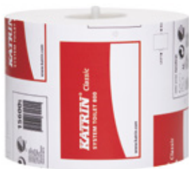
156005 Katrin Classic System Toilet 2-ply, 800 sheets