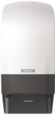
104582 Katrin System Toilet Dispenser White 1/transp pk 313 x 154 x 174 mm