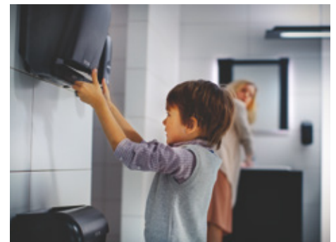
Dispensers are designed to give out just the right amount of paper.