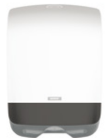
Katrin Hand Towel Mini Dispenser White