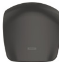
Katrin Gigant S Dispenser Black