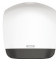
Katrin Gigant S Dispenser White