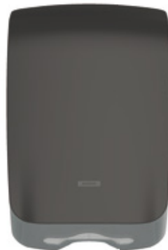
Katrin Hand Towel M Dispenser Black