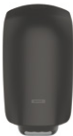
Katrin Centerfeed S Dispenser Black