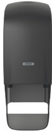
92049 Katrin System Toilet Dispenser Black With Core Catcher 1/transp pk 402 x 154 x 174 mm