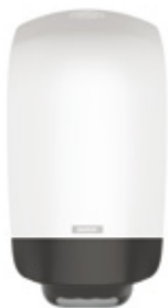
Katrin Centerfeed S Dispenser White