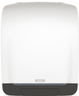
Katrin System Towel Dispenser White