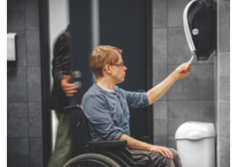
The dispensers are also easier to use for the physically impaired.