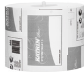
968 Katrin Plus System Toilet 3-ply, 500 sheets