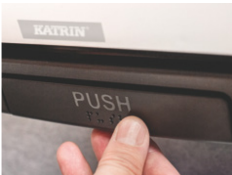
Braille text helps visually impaired users to use the dispenser.