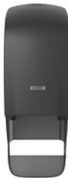
Katrin System Toilet Dispenser Black With Core Catcher