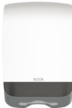
Katrin Hand Towel M Dispenser White