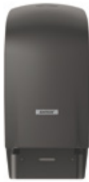
Katrin System Toilet Dispenser Black