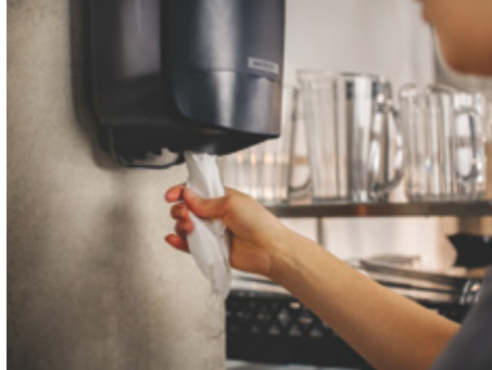
You just need one hand to pull out the tissue papers.