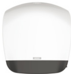
Katrin Gigant L Dispenser White