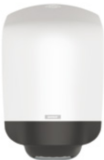
Katrin Centerfeed M Dispenser White