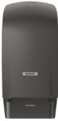
104605 Katrin System Toilet Dispenser Black 1/transp pk 313 x 154 x 174 mm