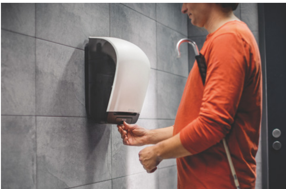
Contrasting colours make the dispenser easy to locate.

A quick and hygienic way to wash and dry hands with hypoallergenic tested tissue papers.