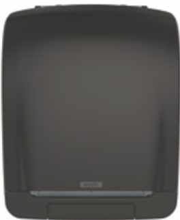
Katrin System Towel Dispenser Black