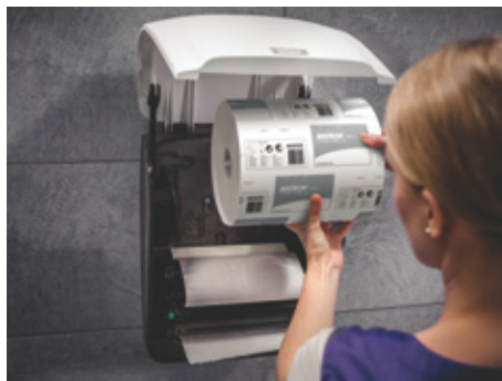
Stub roll function helps to use the last sheets of the paper roll and the direct transition to the next roll.