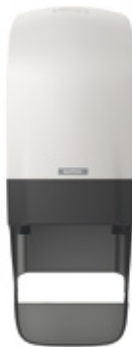
Katrin System Toilet Dispenser White With Core Catcher