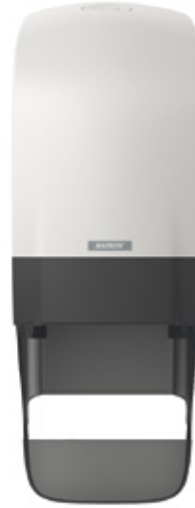
90144 Katrin System Toilet Dispenser White With Core Catcher 1/transp pk 402 x 154 x 174 mm